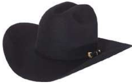
Baileys Felt Hat - 10X (Your size, Your color)